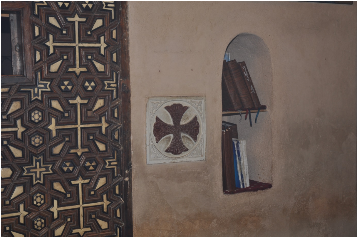
Fig. 4. The niche for books in the monastic church