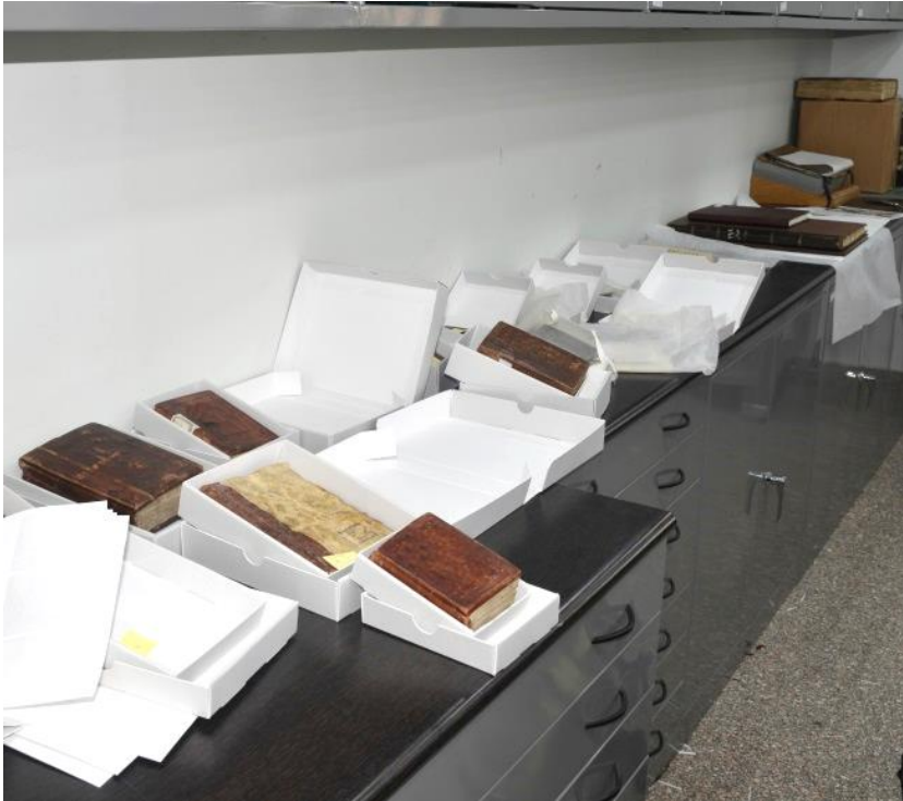
Fig. 2. Archival boxes are being prepared and distributed.